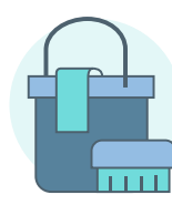
Mop or cloth and soapy water